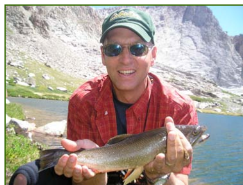
The Popo Agie Wilderness offers beautiful scenery and fruitful fishing.

road can be used by non-tribal members with one fairly large financial catch.....YOU must have a Tribal Fishing Permit (sometimes called a trespass permit) simply to cross, even if you don't get out of your vehicle, while traveling to our