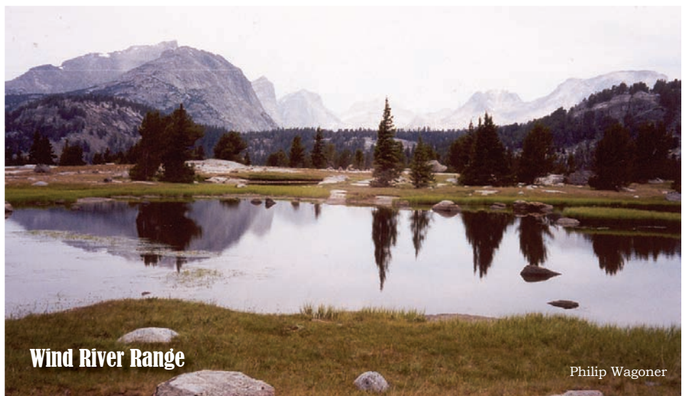
Wind River Range

In terms of geology, the Absaroka Range is the only western range formed by ancient volcanic eruptions. This mountain range extends from SE Montana to NW Wyoming. We visit the SE portion of the Absarokas just north of Dubois, WY. It is lush with wildflowers,